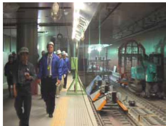
Nearly-finished platform and railroad track