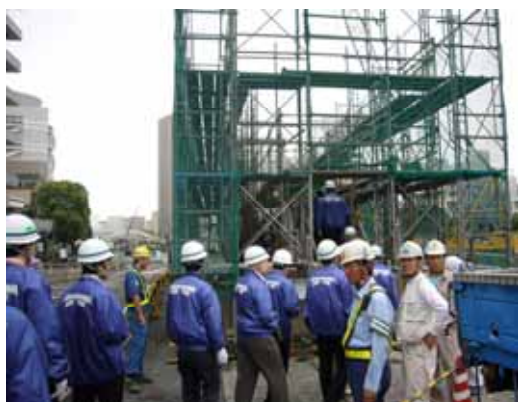
Entrance of the construction site