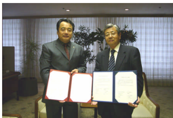
Agreement officially formed